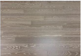
DIRECT SPECIAL #7