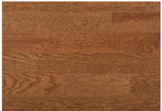
DIRECT SPECIAL #8