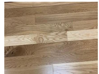
DIRECT SPECIAL #4