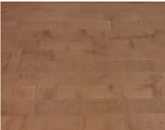
DIRECT SPECIAL #1