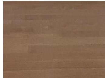
DIRECT SPECIAL #3