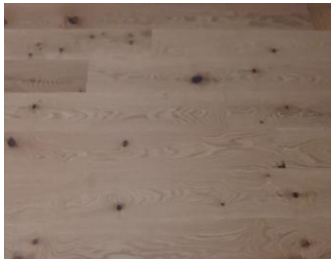
DIRECT SPECIAL #2